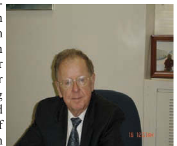
Senator Charles Colgan greets & opened his office to local youth on Legislative Day

continued with "it's cheaper to keep them out of trouble than to pay for them when they are in trouble. We can build better facilities for our youth or bigger jails for our men." Senator Colgan believes that encouraging children to get a good education and stay in school will keep them out of